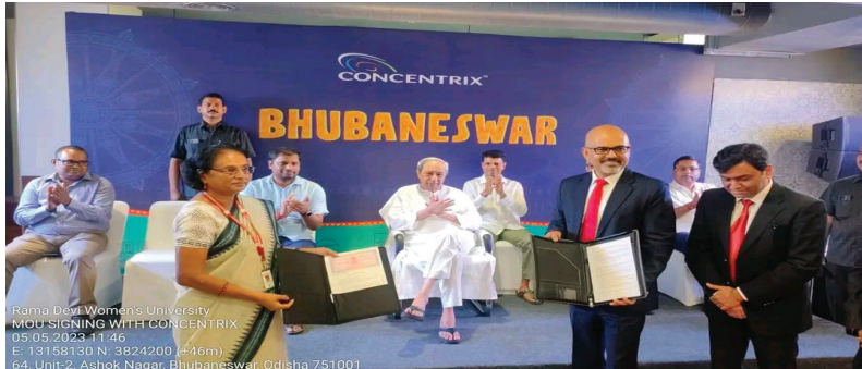
Rama Devi Women's University MOU SIGNING WITH CONCENTRIX 05.05.2023 11:46 E: 13158130 N: 3824200 (+46m) 64, Unit-2, Ashok Nagar, Bhubaneswar, Odisha 751001

gaps, preparing students for diverse sectors. It also facilitates internships and placements, fostering experience and professional networks. The partnership supports RDWU's commitment to women's education and empowerment, with government officials' endorsement underscoring its significance. Through such alliances, RDWU continues catalyzing regional growth while empowering women