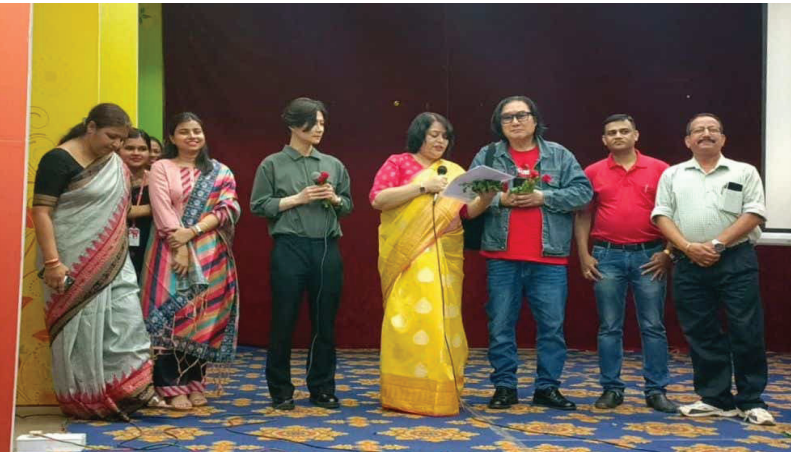
A seminar and screen-Rama Devi Women's Uni- g on contemporary versity in Bhubaneswar. Korean cinema was The event was hosted by held on May 13, 2023 at the university's Depart-